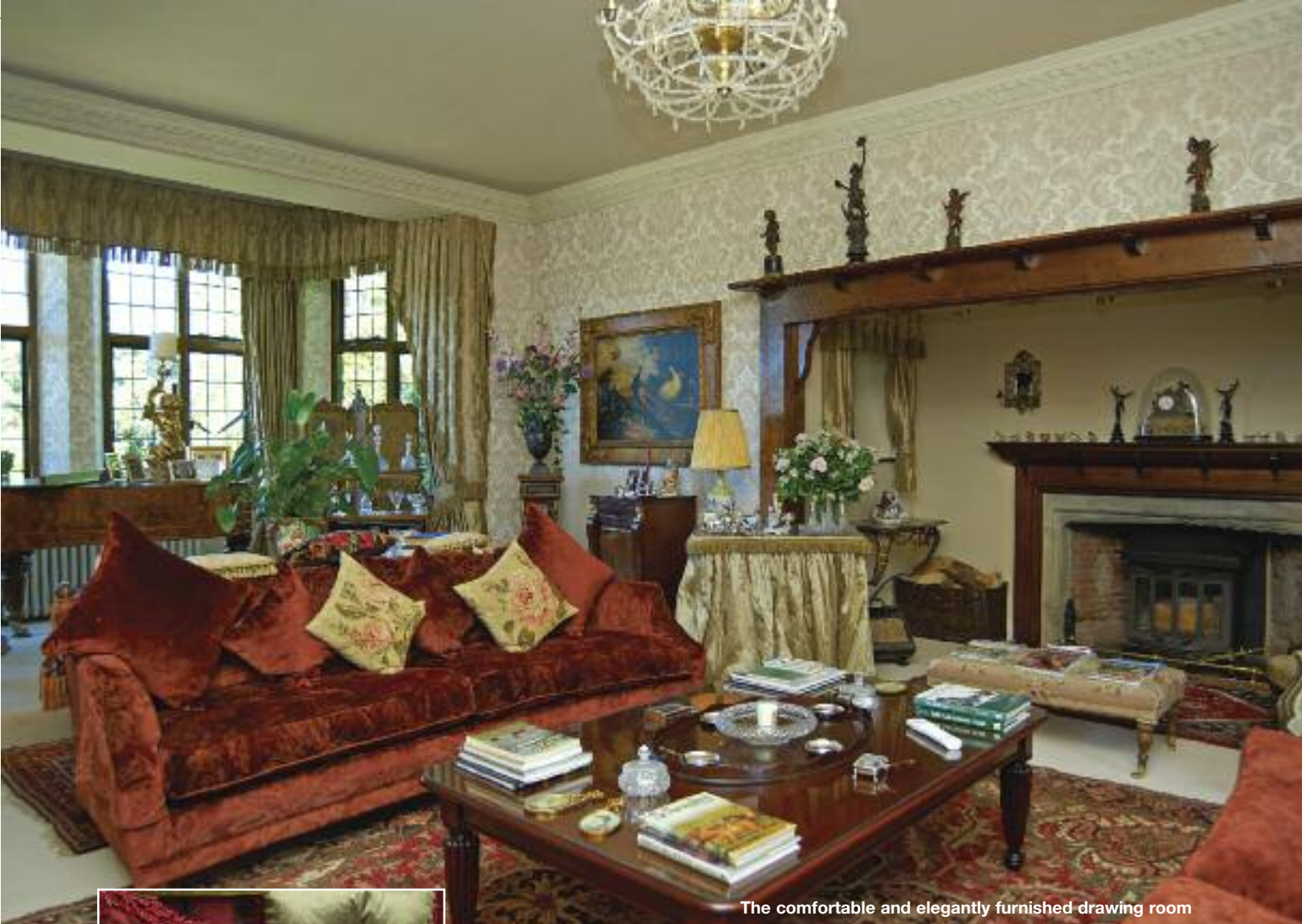
The comfortable and elegantly furnished drawing room