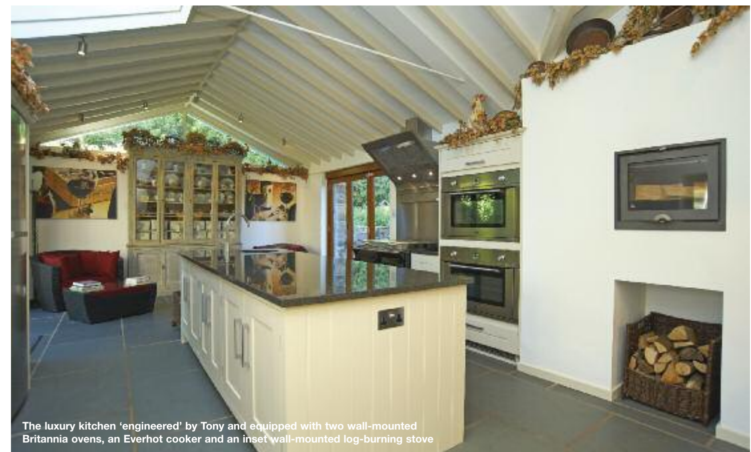
The luxury kitchen 'engineered' by Tony and equipped with two wall-mounted Britannia ovens, an Everhot cooker and an inset wall-mounted log-burning stove