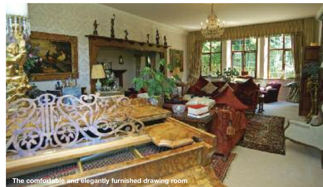
The comfortable and elegantly furnished drawing room