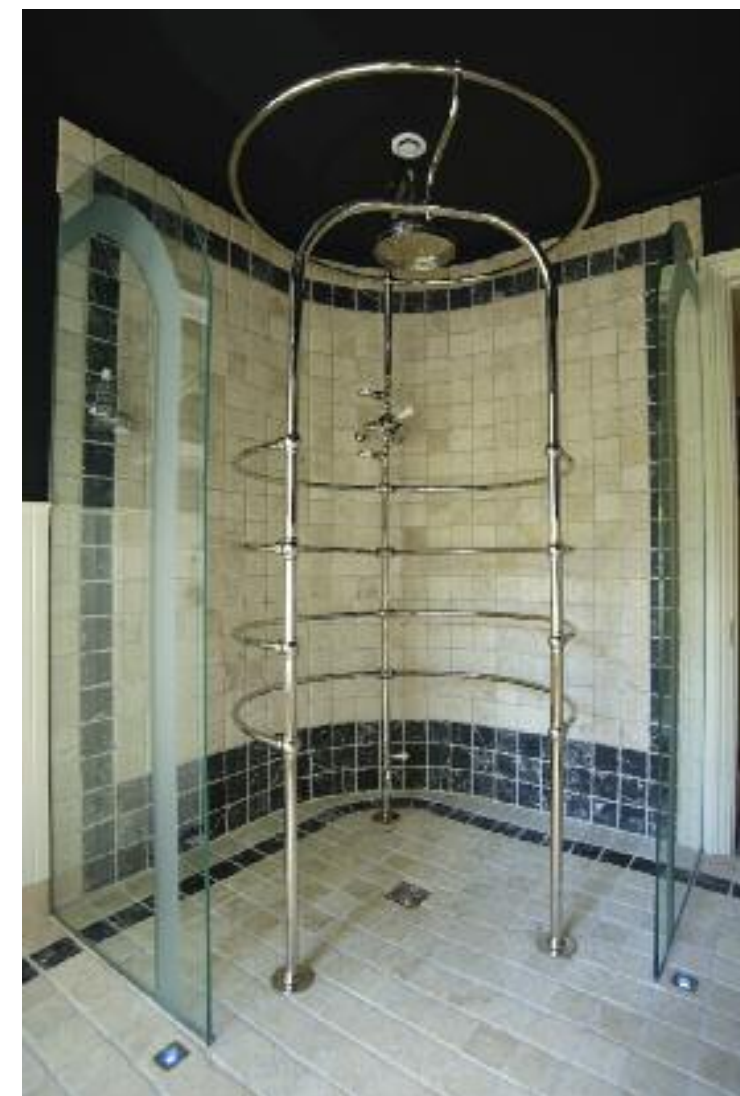
Above A guest bedroom with black and silver theme Left Stylish circular shower Below En-suite bathroom for the black-themed bedroom Bottom The dog shower and dryer