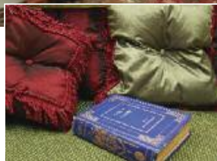
Above Stag-patterned cushions and RD Blackmore's Lorna Doone Below The comfortably furnished reception hall